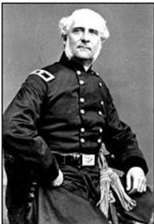
MGen. James Wadsworth USA

Major General James Samuel Wadsworth – 2nd Brigade, 3rd Division, I Corps - Army of the Potomac. Killed in Action. He was born in Genesco, New York in 1807. His father was the owner of one of the largest portfolios of cultivated land in the state. He attended both Harvard University and Yale University where he studied law. He was admitted to the bar but had no intention of practicing. He spent the majority of his life managing his family's estate.